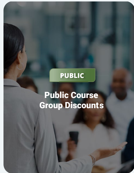
Groups of 5+ employees attending public training in-person or virtually

We offer several training methods for you to select from and blend to meet your organization's needs: