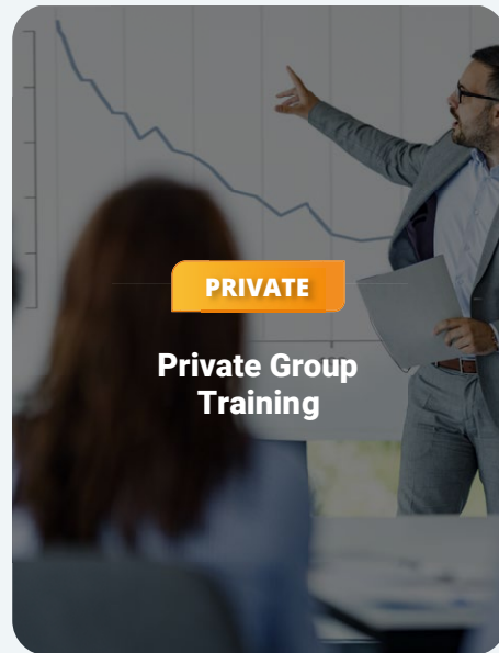
Groups of 10+ employees seeking training virtually or on-site